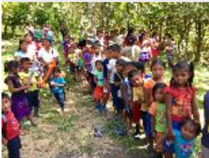
Visit to the Cuchey Indigenous village during the HRTWAM teen camp