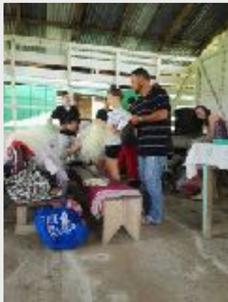
Founded In Truth missions team sorting the clothes donations to Indigenous