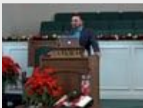
Click here for video link