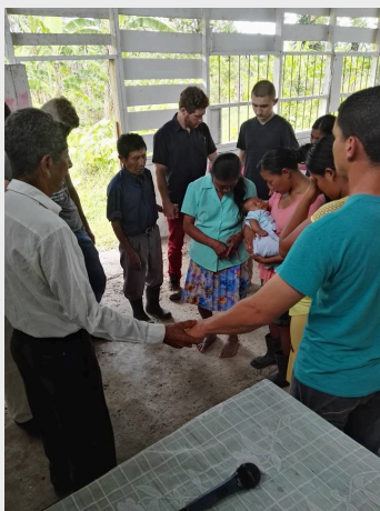
Founded In Truth missions team praying for the Indigenous in Cuchey