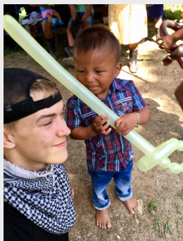
2017 HRTWAM TEEN CAMP