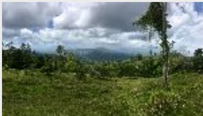
View from Beit Lechem Farm Valle de la Estrella, Limon, Costa Rica