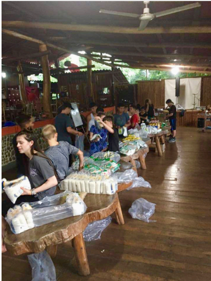
HRTWAM teens packing up food bags for Cabecar Indigenous