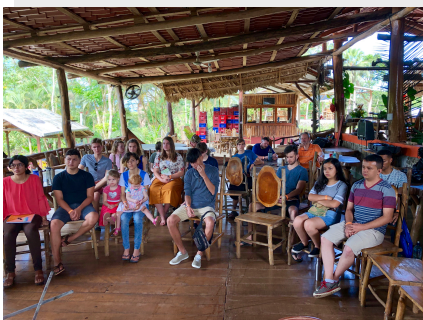
HRTWAM 2019 Teens