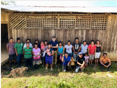
Indigenous families from the Los Angeles community that Captain's Cocoa Company is doing ministry with