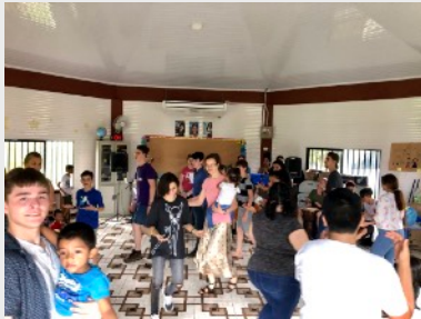
Hebraic dance with children at the Aldeas Infantiles orphanage in Limon, Costa Rica