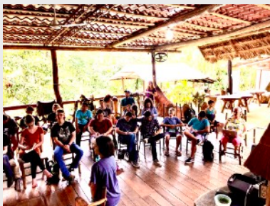
One of our teaching sessions at HRTWAM 2020