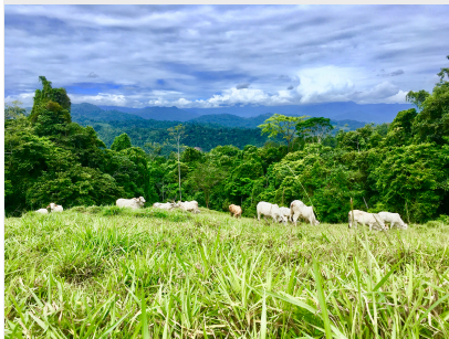
View from Beit Lechem Farm