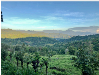
View from Beit Lechem Farm